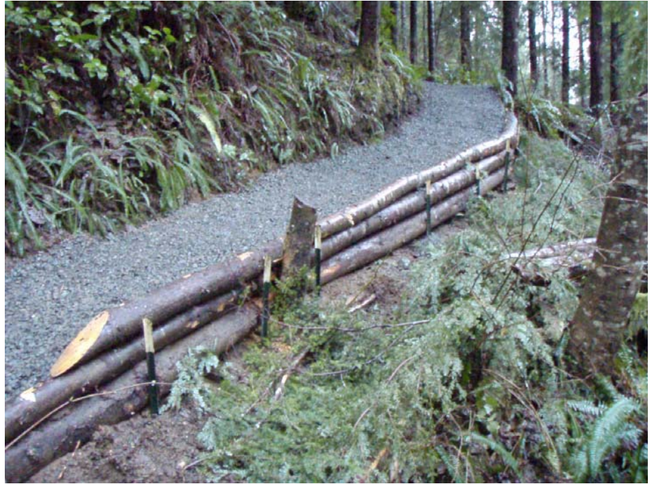
ONRC Trail with recent renovations

Being a recognized Red Cross Shelter and trying to find ways to limit staff downtime because of power outages is the driving force behind this project. We need to be able to continue with not only our day-to-day workload when the power is out, but we also need to be able to offer the use of the facility in times of disaster. Hopefully, we can move forward in locating and installing an emergency generator so we can accomplish this.