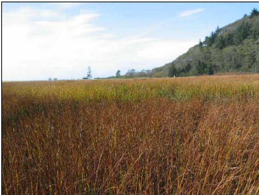
Spartina plants in the foreground are suffering from "hopper burn" as a result of high densities of P. marginata at North Cove, Willapa Bay