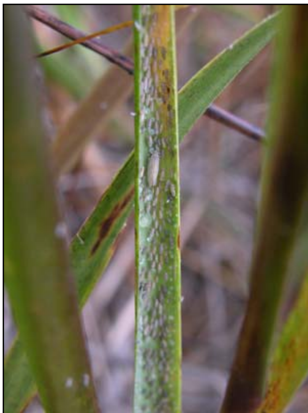
The planthopper Prokelisia marginata has attained densities of 20-30,000 per m 2 in some locations. Visible on this leaf are many nymphs (juvenile stage) and one adult

The Spartina biocontrol program recently received a boost from the National Sea