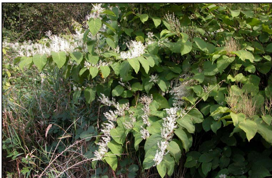
Invasive knotweeds ( Fallopia species) are the next target of the UW ONRC Weed Biocontrol Program

already being developed in Europe, where knotweed is also a serious environmental problem. Several promising insects and pathogens from Asia (knotweed's native range) have been identified by the Commonwealth Agricultural Bureaux International (CABI) Biosciences in the United Kingdom. These agents are currently being tested for their host specificity. Because the bulk of the preliminary research has already been completed by the Europeans, biocontrol of knotweeds in the United States could be accomplished with relatively low cost of development. I will be carrying out research to ensure that the candidate agents will not feed on native North American plants that were not previously tested by the European program. UW ONRC is working with the USDA Forest Service and other groups to secure funding to carry out this work.