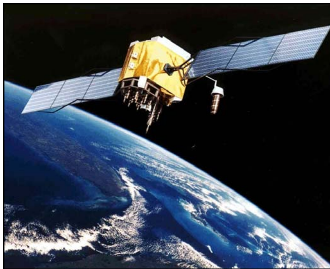
NAVSTAR BLOCK II Satellite Orbiting Earth

scopic controls, and internal systems, the Block II satellite was too heavy to be launched on an Atlas-Centaur rocket. The most economical solution to getting these satellites into a high enough orbit was NASA's Space Shuttle. Unfortunately, the STS-51 (Space Transportation System) Challenger disaster was a major setback in the deployment of the GPS satellite constellation. Without STS launches, there was no longer a US medium for placing satellites the size of the Block II into geosynchronous orbit.