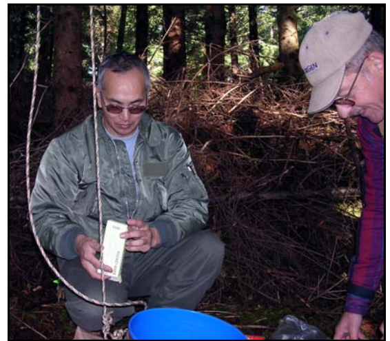
Workshop Participants Locate Geocache Using GPS Units

The workshop included a 45-minute discussion on how GPS technology works in non-technical language. The class then divided up into small groups and embarked on an adventure using their GPS units. Some participants brought their own GPS receiver and some used one of UW ONRC's Magellan Sport Trak Map GPS receivers.