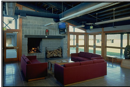
The ONRC Social Hall - available for rent as meeting room , dining hall or reception space

is an ideal place for retreats and groups of less than 50 people. The large fireplace, expansive windows and adjoining kitchen make this room a favorite meeting place at ONRC.